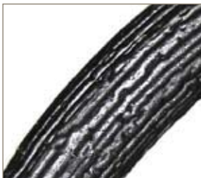
High temp. FFKM after