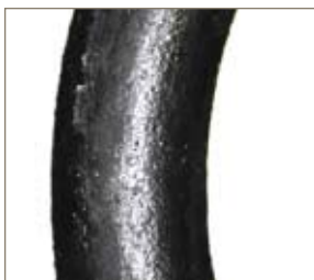
Competitor A after