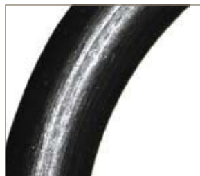
High temp. FFKM before