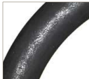
Competitor A before